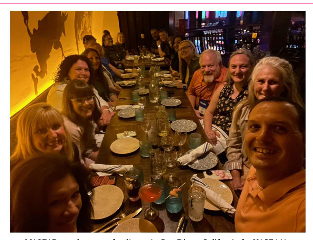
MASFAP members met for dinner in San Diego, California for NASFAA!