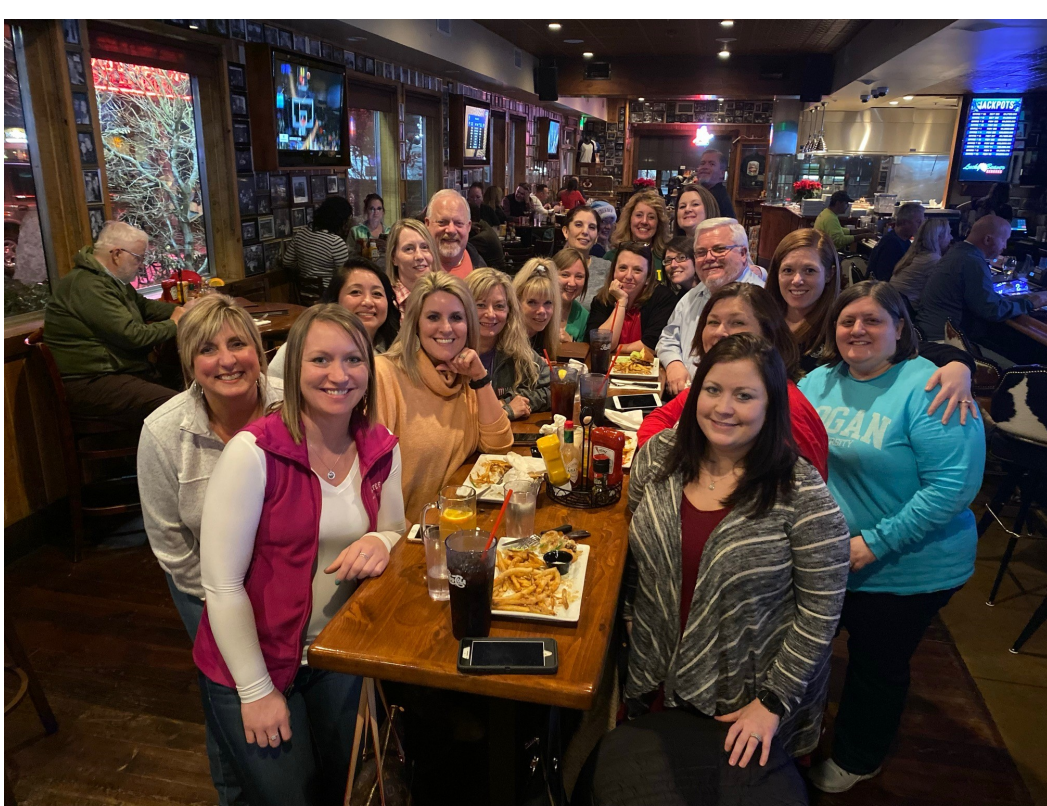
Pictures from FSA in Reno—MASFAP members gathered for dinner one evening