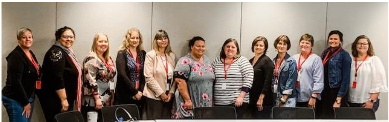
Picture of the MASFAP Town Hall held in June